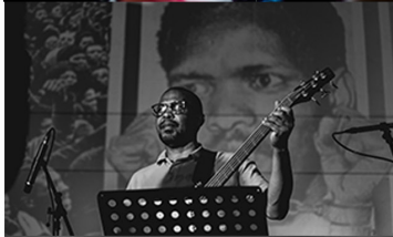
Steve Biko 76th birthday with the music of Johnny Mbizo Dyani